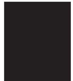
Full Page Ad