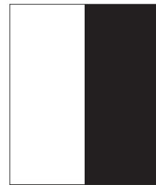
1/2 Page Ad